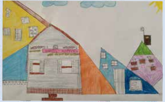
Norme-Lee, age 13

We asked the kids what they liked about the old hoopsig house and about their wishes for the new house - read their answers!