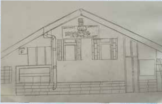
Simamkele, age 14

"I would like to have games, a slide from the roof, a swing and a trampoline in the new Hoopsig house. Also it would be nice to have a swimming pool and a red house."