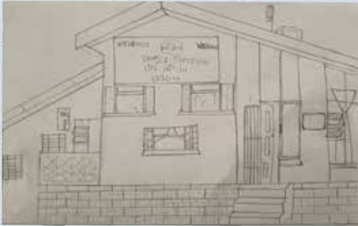
Abednego, age 16

In the workshop "Drawing", lead by German volunteer Lara, the kids learned different styles of drawing and had the chance to express themselves in their unique way!