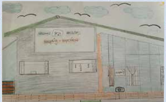
Liyabona, age 13